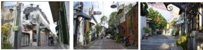
Figure 2 The atmosphere of Surakarta's Kauman batik village

Drawing upon the concepts of place-related identity and urban identity, it is insightful to examine the case of Kampung Kauman in Surakarta in relation to the formation of urban identity. Kampung Kauman represents a unique historical neighborhood within Surakarta, renowned for its rich cultural heritage and deep-rooted traditions. The close-knit community of Kampung Kauman has played a significant role in shaping the identity of its residents and fostering a strong sense of belonging, see figure 2 above.