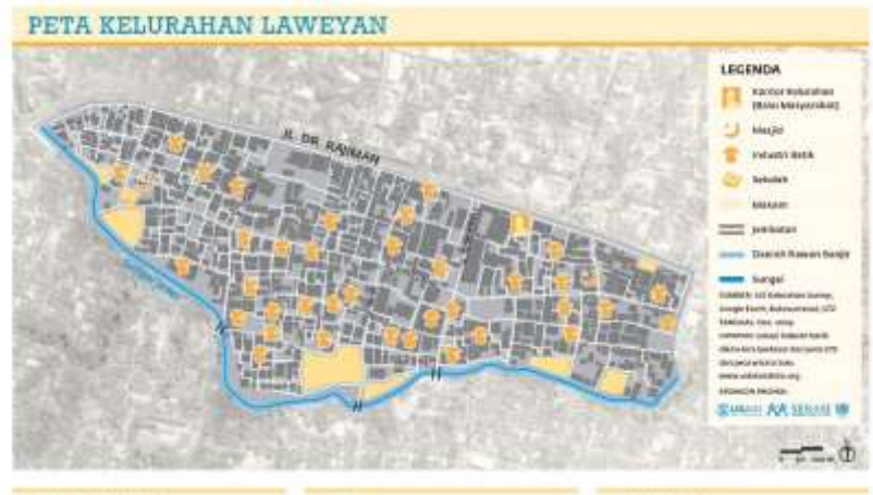
Figure 3 Map of Kampung Laweyan, Surakarta.

Kampung Laweyan is not only known for its batik industry but also for its cultural heritage. The village organizes various cultural events and performances, providing visitors with a deeper understanding of Javanese traditions and arts. Traditional Javanese music, dance, and theatrical performances are showcased, allowing visitors to immerse themselves in the rich cultural tapestry of Solo. The community of Kampung Laweyan takes great pride in their batik heritage and actively engages in preserving and promoting their cultural traditions. They have formed cooperative groups to support the local batik industry and ensure its sustainability. The village has undergone revitalization efforts to enhance its appeal as a cultural destination, while still preserving its authentic charm. A visit to Kampung Laweyan offers a unique cultural experience, providing an opportunity to witness the artistry of batik-making, explore traditional Javanese architecture, and engage with the warm and welcoming community. It is a place where tradition and creativity intertwine, creating