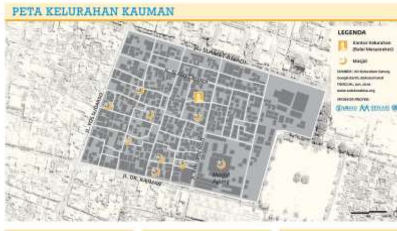
Figure 1 Map of Kampung Kauman, Surakarta.

Drawing upon the concepts of place-related identity and urban identity, it is insightful to examine the case of Kampung Kauman in Surakarta in relation to the formation of urban identity. Kampung Kauman represents a unique historical neighborhood within Surakarta, renowned for its rich cultural heritage and deep-rooted traditions. The close-knit community of Kampung Kauman has played a significant role in shaping the identity of its residents and fostering a strong sense of belonging, see figure 2 above.