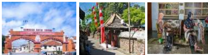
Figure 7 The atmosphere of Trusmi batik village in Cirebon.

The inform urban planning and community development strategies in Kampung Trusmi. By recognizing the sociodemographic characteristics that influence urban identity dimensions, policymakers and community stakeholders can design targeted initiatives to foster a stronger sense of identity and engagement among different demographic groups. This may include tailored programs to involve younger generations or specific occupational groups in preserving and promoting the traditional industries and cultural heritage of the village. The study on urban identity and sociodemographic characteristics to Kampung Trusmi in Cirebon allows us to explore how factors such as age, gender, education, and occupation shape the residents' sense of identity and attachment to the village. By understanding these connections, urban planners and community stakeholders can develop strategies to preserve and promote the unique cultural heritage of Kampung Trusmi and foster a strong and cohesive urban identity among its residents.