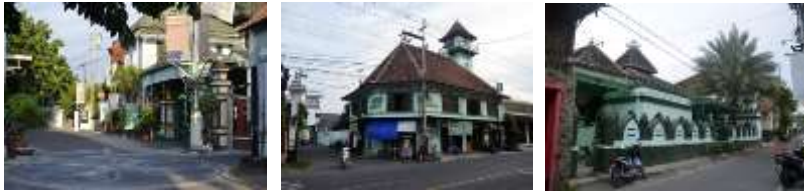
Figure 4 The atmosphere of Surakarta's Kemlayan batik village.

a vibrant and captivating atmosphere that celebrates the rich heritage of Solo, see figure 4 above.